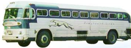
Prototype photo shown