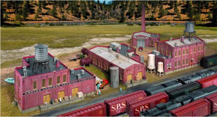
N Cornerstone Modulares Empire Leather Tanning 933-3299 $99.98