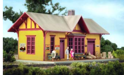
N Cornerstone Series Built-ups Golden Valley Depot $29.98 933-2607 Yellow Ochre w/Oxide Brown Trim 933-2608 Cream w/Railroad Green Trim 933-2609 Light Gray w/Dark Gray Trim

Can't find a hobby shop near you? Call 1-800-4TRAINS (1-800-487-2467) or visit waltthers.com .