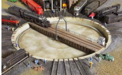
N Cornerstone Series Built-ups Modern 130' Turntable 933-2613 $299.98