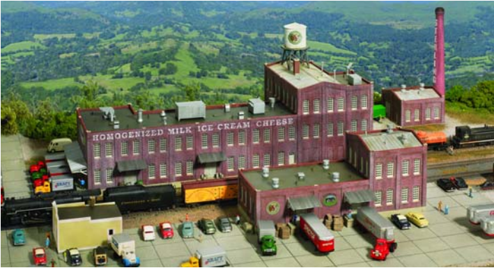
N Cornerstone Modulares™ Sterling Consolidated Dairy 933-3298 $149.98