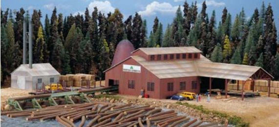
N Cornerstone Series Kit Mountain Lumber Company Sawmill 933-3236 $49.98