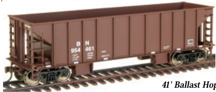
41' Ballast Hoppers