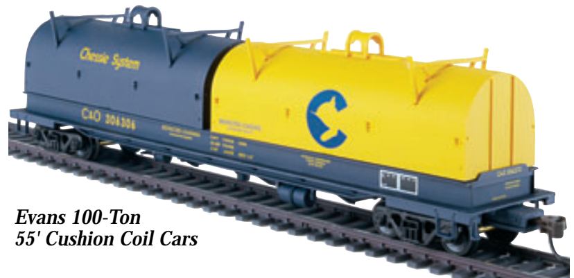
Evans 100-Ton 55' Cushion Coil Cars

Can't find a hobby shop near you? Call 1-800-4TRAINS (1-800-487-2467) or visit walthers.com