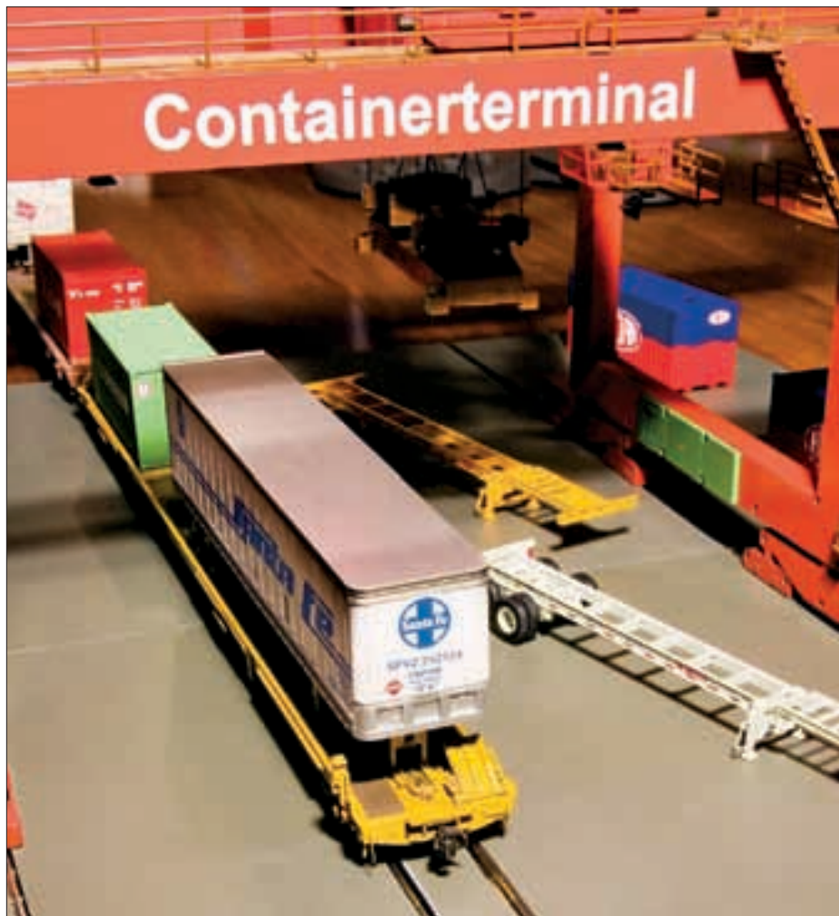
A cut of cars is spotted beneath the crane in preparation for an off-load of the containers. Although the Heljan Crane is only set up to work with 20-foot containers, metal strips can be placed inside of larger containers and inside of piggyback trailers allowing them to be moved as well. Prototypical exactness suffers when moving larger containers and piggyback trailers because the lift crane that contains the electromagnet is fixed at 20 feet. Piggyback trailers require bottom or sill lifting, and overhead lift equipment is always fitted with retractable arms that reach under the trailer to lift it. Remember that up to 5 tracks can be cut into the base, potentially creating a very busy facility.

is the controller, which is designed for a very intuitive feel and can control up to three container cranes. Its compact, 4.5 x 3.5 x 1 inch dimensions allow for both freestanding and hand-held operation. The large diamond-shaped directional button controls both back and forth gantry movement (labeled East and West) and crane movement across the gantry (labeled North and South) and these motions can be performed simultaneously.