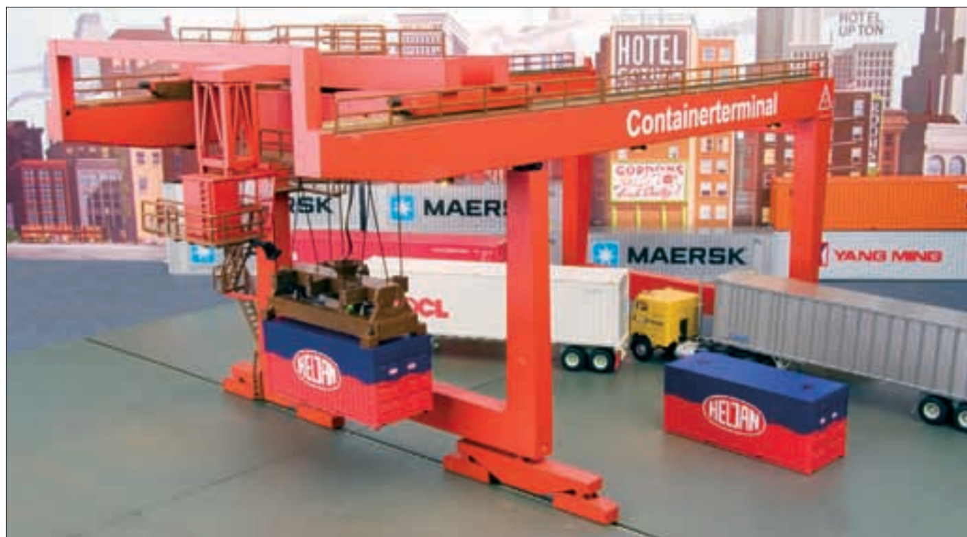
The massive size of this model is clearly represented by the semi trucks parked beneath it. Watching the gantry move is impressive and adding extra base plate sections can increase the size of the facility. Up to three gantry cranes can be used to create a very busy terminal. Power for the crane is supplied via the base rail. The container can be rotated 180 degrees by the hoist. It is fascinating to watch.

The heavy orange container crane and its separate components arrived carefully packed in a rather large box that revealed a preassembled lateral crane and its supporting gantry. Close attention to the clearly written instruction manual during unpacking and assembly will be rewarded by the relative ease that it goes from the box to fully operational. Some assembling and placing of separate components is required in order to complete the crane and base as a working unit. This assembly mainly consists of configuring the paved base, fitting together the two crane