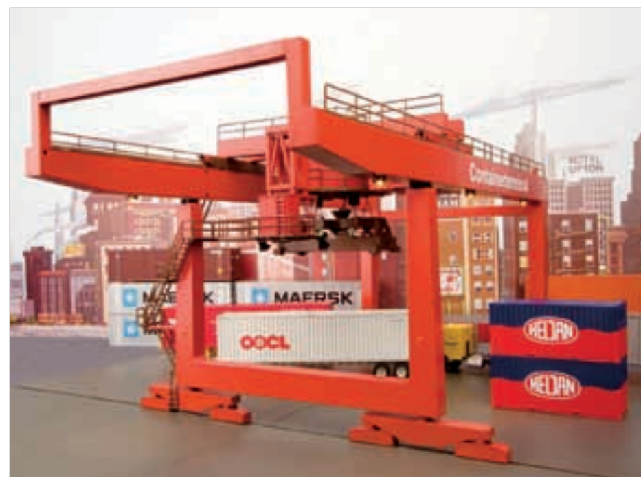
The all-metal gantry is completely remote controlled. An electromagnet in the hoist can be positioned over a container and the crane can then be used to move that container onto a car, truck, or onto the base plate. The animation built into the crane allows the container to be moved side-ways, rotated 180 degrees, and carried down the length of the base plate.