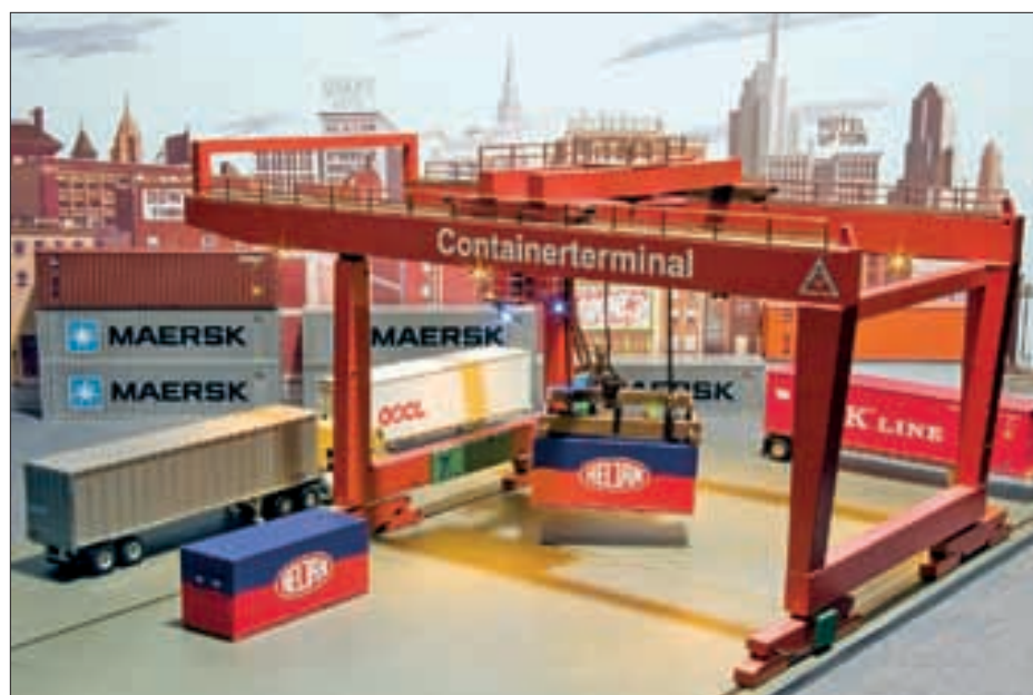
Because of its unique remote control capabilities, this container crane can be used in any intermodal facility or shipside dock. With a little modification any container can be lifted, moved, and placed on the base plate. The digital controlled crane has adjustable speed steps like locomotive decoders. This allows the crane to be adjusted to the likes of any operator. The crane uses two built-in, programmable decoders, one for the gantry and one for the crane/hoist. The lack of visible wiring makes the structure very believable and with a little weathering, the gantry would look right at home on even the best detailed railroads. Note the functioning lights on the crane; these can be controlled as well.