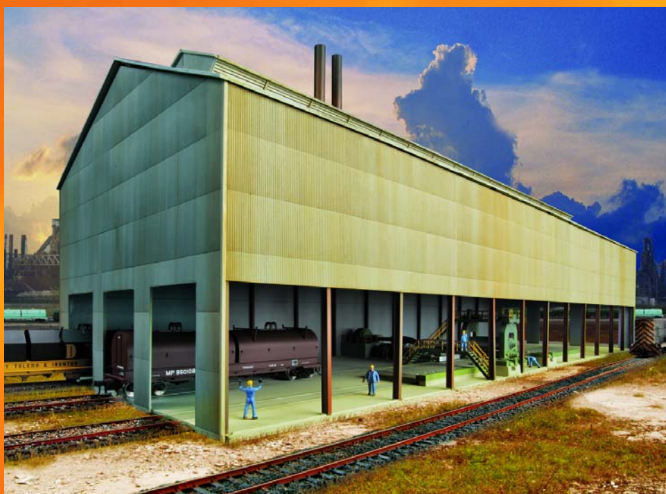
HO Rolling Mill Kit