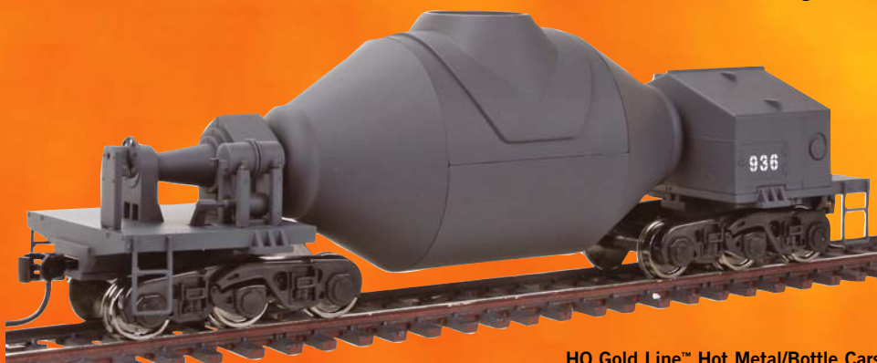
HO Gold Line™ Hot Metal/Bottle Cars