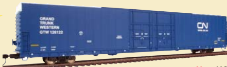
New HO Gold Line 86' Pullman-Standard Hi-Cube 4-Door Boxcars 932-35018 Series