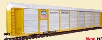
New HO Gold Line Tri-Level Enclosed Auto Carriers 932-4884 Series

See your dealer today for complete details! No hobby shop near you? Call 1-800-4TRAINS (1-800-487-2467) or visit walthers.com for more information. Preproduction models shown, some details may vary. Delivery date shown was accurate at press time, for updates, visit walthers.com . 1 Union Pacific licensed product. *CSX proprietary marks used by permission of CSX Transportation, Inc. ©2008 Wm. K. Walthers, Inc.