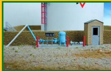
Truck Loading Facilities