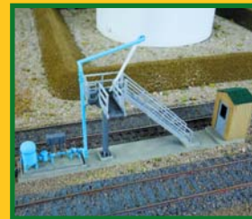
Tank Car Loading Facilities