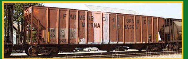
HO GOLD LINE™ EVANS 4780 CU. FT. COVERED HOPPER 933-41200 Series $29.98 July 2010 Delivery MKT/UP®, Soo Line, CP, DM&E, EEC, ADM® (New), ADM® (blue), Undecorated