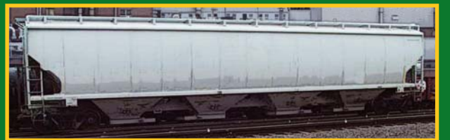
HO GOLD LINE TRINITY 6351 4-BAY COVERED HOPPER 933-41100 Series $34.98 August 2010 Delivery North American Ethanol, ADMX, VeraSun Energy TILX, Midwest DDG Transport MWTX, CRDX, TILX, Undecorated