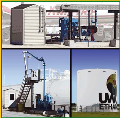
HO TANKS, PIPES, LOADING/UNLOADING RACK 933-2980 $74.98 July 2010 Delivery Includes Ethanol Storage Tank with Caged Ladder, Ground Loading Platform for Truck Loading Area, Tall Loading Platform for Rail Loading Area, 10 Tall Pipe Support Tees, 10 Short Pipe Support Tees, 2 Sheds, 2 Pumps & Piping