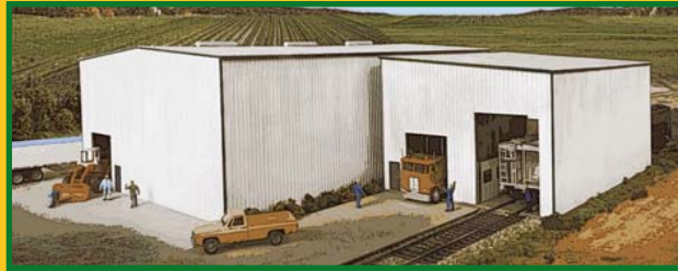
HO CORN UNLOADING & STORAGE SHEDS 933-2974 $79.98 October 2009 Delivery Includes Large & Small Sheds, Interior Shack & Discharge Grate