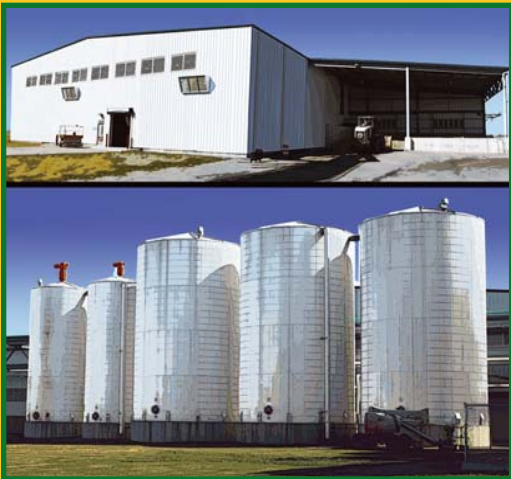
HO ENERGY CENTER 933-2978 $89.98 June 2010 Delivery Includes Building with Outside Covered DDG Storage Area, Outside Stack, 5 Tanks & DDG Conveyor Piping

First Release Arriving Fall 2009 — Reserve your Ethanol Series Today!