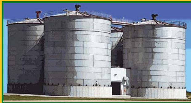
HO FERMENTATION TANKS 933-2977 $79.98 March 2010 Delivery Includes 3 Fermentation Tanks, 1 Beer Well & Fermentation Building