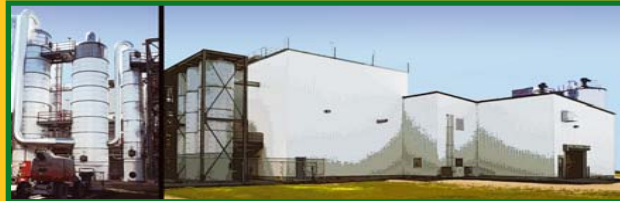
HO PROCESSING CENTER 933-2976 $69.98 December 2009 Delivery Includes Main Building, 5 Tanks, 3 Distillation Towers, Outside Stairway & Roof Vents