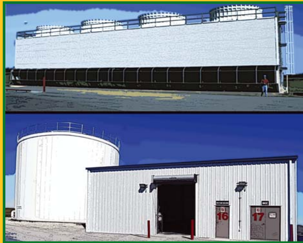
HO COOLING TOWER FACILITY 933-2979 $49.98 January 2010 Delivery Includes Cooling Tower, Water Storage Tank & Shed

See more information at walthers.com/ethanol