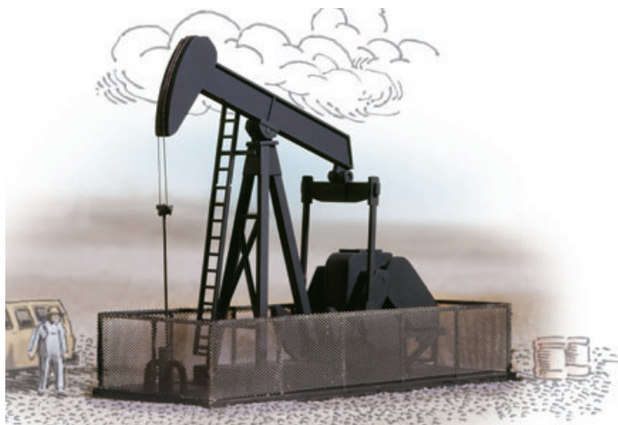
O Scale Walking Beam Oil Pump 933-2705