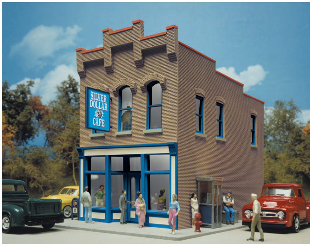
HO Scale Silver Dollar Cafe 933-2815