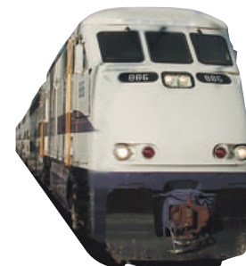
Athearn N Scale will release an EMD F59PHI