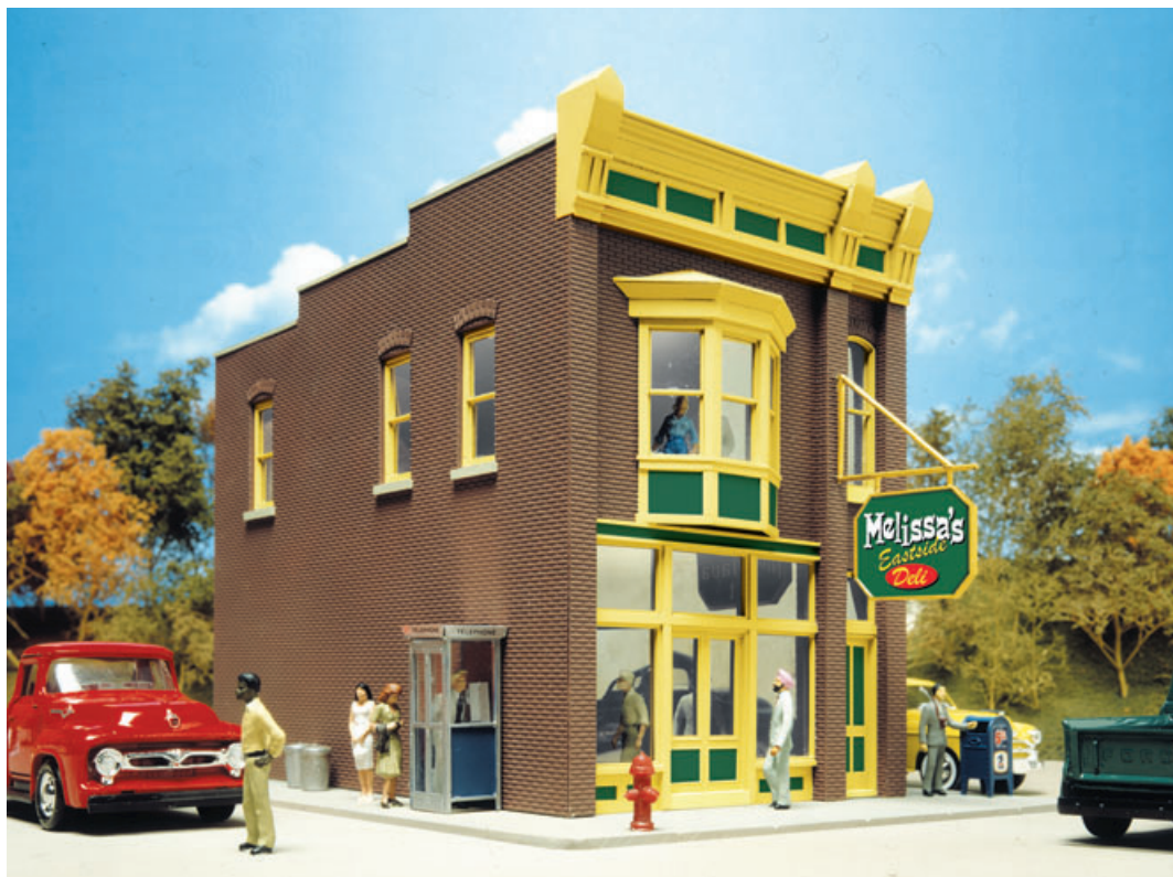
O Scale Melissa's East Side Deli 933-2711