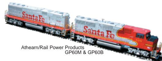
Athearn/Rail Power Products GP60M & GP60B

Displayed at the show were a wide range of new Genesis, Ready-To-Roll and licensed models. New releases include newly introduced equipment as well as exciting new paint schemes. For complete information please visit www.athearn.com .