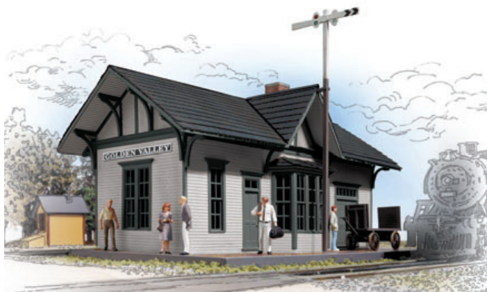
HO Scale Golden Valley Depot 933-2808