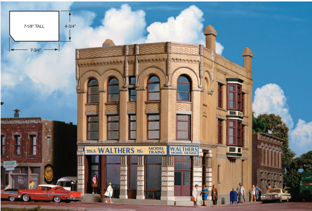
HO Scale Walther's Water Street Building 933-2814

Based on a typical early 1900s design, Fire Co. No. 4 is right at home with factories, railroad facilities or commercial buildings. Also ideal as a display model, it's deep enough to handle most ladder trucks. Realistic decals are provided for customizing.