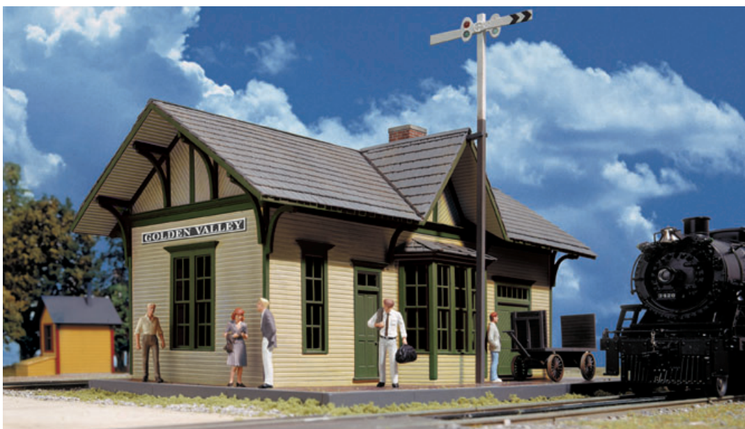
HO Scale Golden Valley Depot 933-2807

Halt highway traffic with this working model on your O/O-27 layout. Gate comes fully assembled with black and white arm, a red LED signal, realistic counterweight and base. Connect to your power pack, then press the push-button switch to lower or raise the gate and activate the red warning signal. Designed for easy operation, it can be modified for use with automated systems (sold separately).