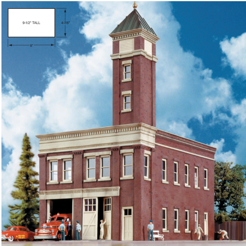
HO Scale Fire Co. No. 4 933-2809

Transform empty lots into busy commercial areas with these buildings. Great for small towns or big cities, each is fully assembled and includes a working interior light.